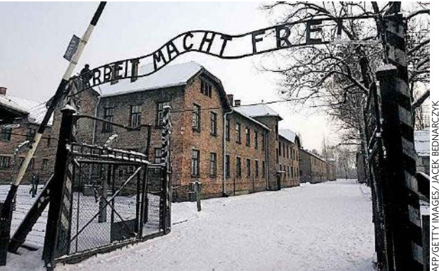
"In Paradise" explores the powerful attraction of Auschwitz.

To connect the philosophi-cal questions and the crew of characters, Matthiessen